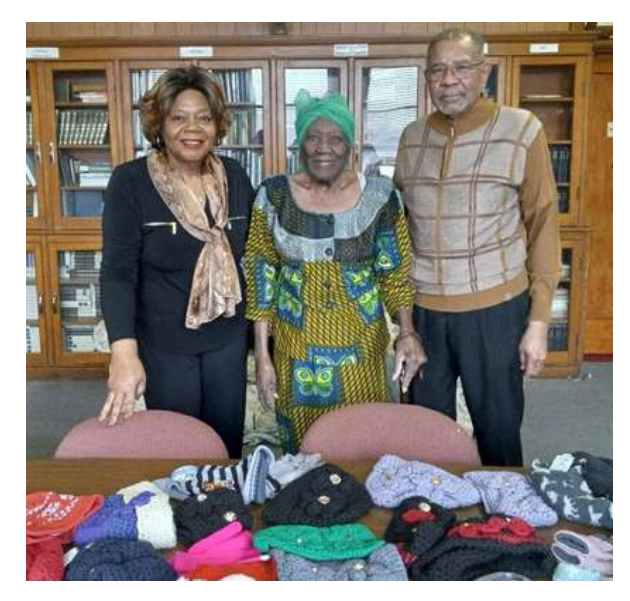
St. Paul Missionaries Bureau of Supply led the Hat & Gloves initiative to provide for those in need.