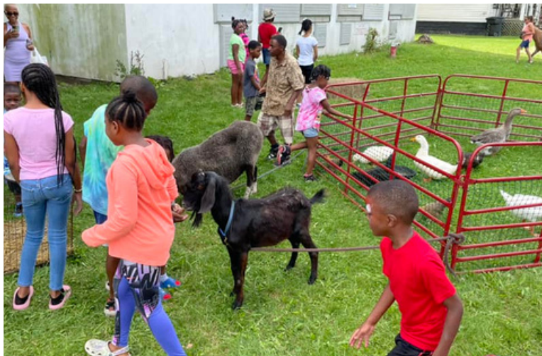
Children from the community and St. Paul enjoying the petting zoo.